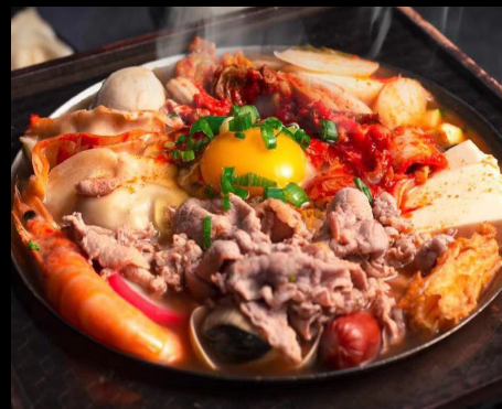
Suggested Calories: 687.1

台灣高麗菜, 豬肉, 泡菜, 餃子, 年糕, 小香腸, 大蝦, 金針菇, 魚板, 甜不辣, 蛤蜊, 福州魚丸, 嫩豆腐, 炸豆皮, 義大利瓜, 蟹肉片, 雞蛋, 蔥