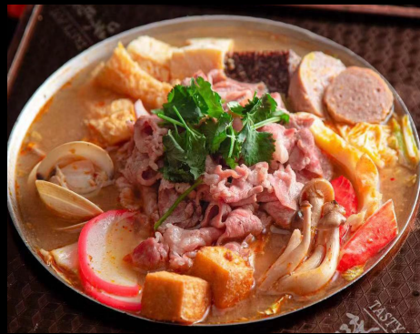
含有花生成分 CONTAINS NUTS Suggested Calories: 702.4

大白菜, 羊肉, 冬粉, 金針菇, 蟹肉片, 貢丸, 魚卷, 魚板, 豬血糕, 炸豆皮, 蛤蜊, 酸菜, 茶樹菇, 豆腐, 香菜