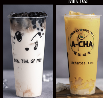
Sweet Milk with Boba Thai Milk Tea