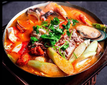
Larger Suggested Calories: 845.1

台灣高麗菜, 豬肉, 胡藜, 金針菇, 茶樹菇, 紅薯粉, 花枝圈, 福州魚丸, 蛤蜊, 螃蟹, 小章魚, 蚌, 大蝦, 甜不辣, 貢丸, 蟹肉片, 香菜