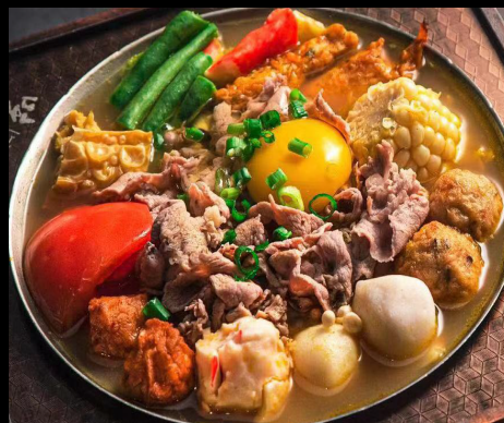
Suggested Calories: 712

大白菜, 豬肉, 冬粉, 番茄, 玉米, 雞蛋, 金針菇, 蟹肉片, 魚板, 魚丸, 炸豆皮, 甜不辣, 四季豆, 黃金魚丸, 杏鮑菇, 炸魚球, 龍蝦丸, 蔥