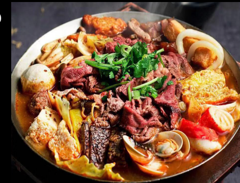
含有花生成分 CONTAINS NUTS Larger Suggested Calories: 898.6

台灣高麗菜, 泡麵, 牛肉, 牛筋, 金針菇, 甜不辣, 蛤蜊, 福州魚丸, 花枝圈, 豬血糕, 大腸, 炸豆皮, 茶樹菇, 豆腐, 蟹肉片, 貢丸, 酸菜, 油豆泡, 香菜, 蔥