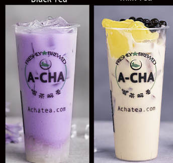
Taro Milk Tea Half & Half Milk Tea