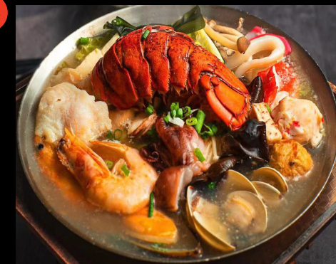
Larger Suggested Calories: 814.3

大白菜, 龍蝦, 嫩豆腐, 冬粉, 金針菇, 海帶, 茶樹菇, 義大利瓜, 黑木耳, 杏鮑菇, 芋頭, 大蝦, 龍利魚片, 蚌, 小章魚, 蛤蜊, 花枝圈, 炸魚球, 龍蝦丸, 魚板, 蔥