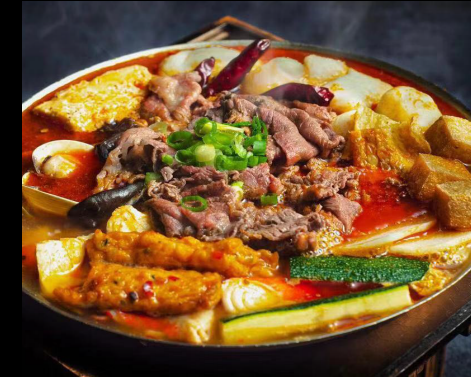
Larger Suggested Calories: 870.7

大白菜, 牛肉, 魚片, 蛤蜊, 黃喉, 蟹肉片, 甜不辣, 魚丸, 灌湯牛肉丸, 義大利瓜, 金針菇, 黑木耳, 馬鈴薯片, 凍豆腐, 油豆泡, 炸豆皮, 紅薯粉, 蔥