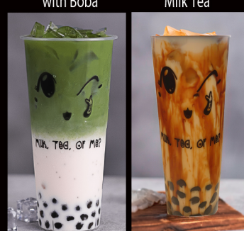
Rose matcha latte with boba Tiger Pearl Milk