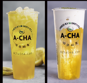
Green Tea Milk Creme Green Tea