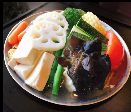
Suggested Calories: 418.6

台灣高麗菜, 冬粉, 金針菇, 番茄, 玉米, 蓮藕, 炸豆皮, 四季豆, 杏鮑菇, 西蘭花, 海帶, 茶樹菇, 芋頭, 竹筍, 嫩豆腐, 義大利瓜, 黑木耳