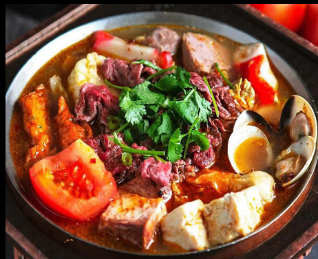
含有花生成分 CONTAINS NUTS Suggested Calories: 726.2

大白菜, 牛肉, 冬粉, 金針菇, 芋頭, 番茄, 豆腐, 甜不辣, 玉米, 貢丸, 魚板, 炸豆皮, 蟹肉片, 魚卷, 蛤蜊, 香菜, 蔥