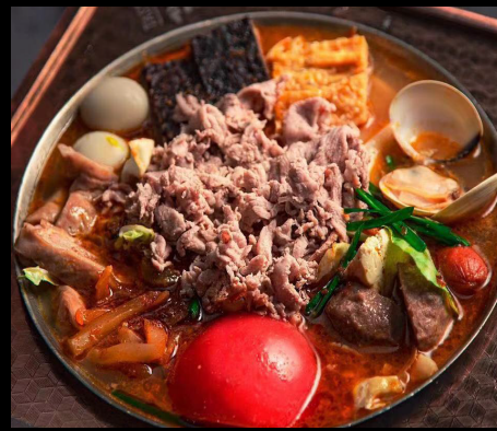
含有花生成分 CONTAINS NUTS Suggested Calories: 714.2

台灣高麗菜, 豬肉, 臭豆腐, 冬粉, 金針菇, 魚板, 蛤蜊, 貢丸, 鵝鶉蛋, 豬血糕, 大腸, 小香腸, 韭菜, 榨菜, 番茄, 炸豆皮