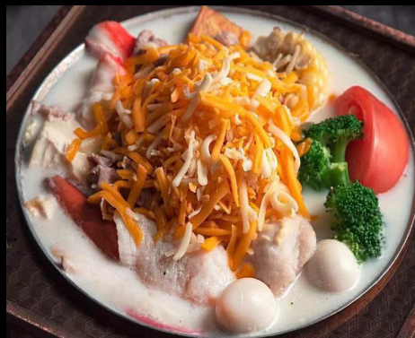
Suggested Calories: 731.3

台灣高麗菜, 豬肉, 冬粉, 小香腸, 金針菇, 番茄, 玉米, 西蘭花, 杏鮑菇, 鵝鶉蛋, 起司, 竹筍, 嫩豆腐, 蟹肉片, 龍利魚片, 魚豆腐, 魚板