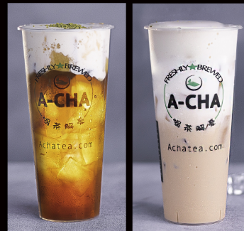
Milk Creme Black Tea Hokkaido Milk Tea