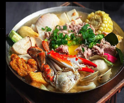
Larger Suggested Calories: 850.6

台灣高麗菜, 豬肉, 螃蟹, 烏冬麵, 金針菇, 蛤蜊, 龍利魚片, 杏鮑菇, 炸豆皮, 嫩豆腐, 魚板, 花枝圈, 玉米, 甜不辣, 魚子魚丸, 海帶, 義大利瓜, 福州魚丸, 雞蛋, 蔥